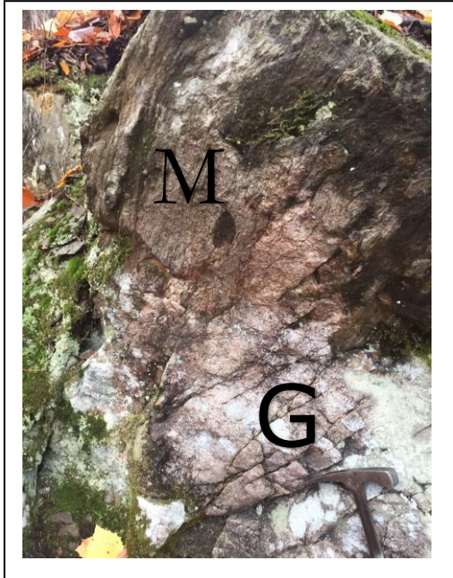
Undeformed granite body (lower right (G)) that intruded mylonitic rocks (M) near the RMC/ Dog River Fault Zone.